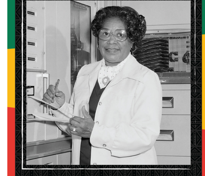
Dr. Angella Dorothea Ferguson Sickle Cell Disease pioneer