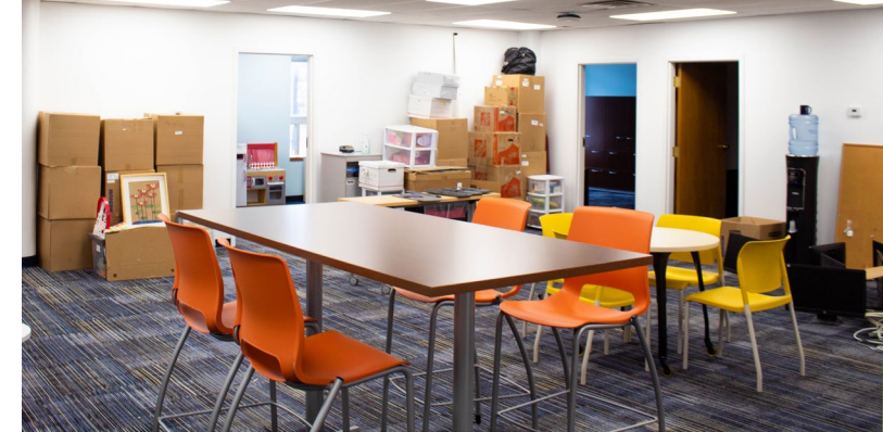
The CCTC team is unpacking and getting settled in their new home.