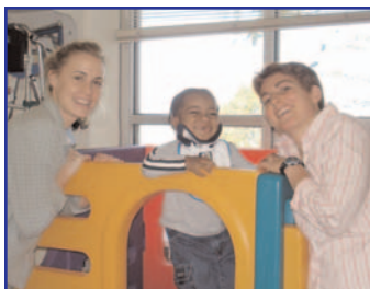
Fidelity Charitable Gift Fund