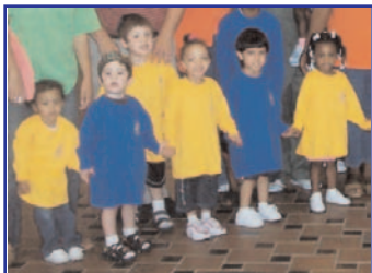
Chicago Community Trust

Here is a listing of the donor advised funds that currently support La Rabida: