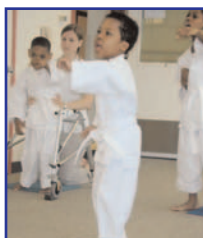
Jewish United Federation