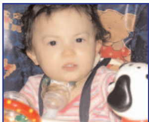
Vanguard Charitable Endowment Program